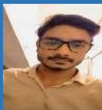
Lalit Bhagya Decor