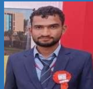
Sachin IOP Paints Ltd.