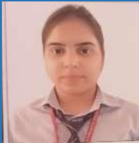
Shiksha Parle Biscuits