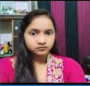
Ranjana SkillsUp 360