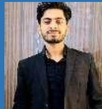
Monu Yutika Naturals