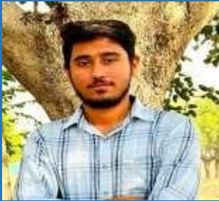
Sahil SkillsUp 360