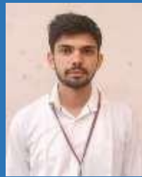
Sachin Axis Bank