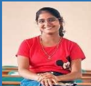
Anjali Parle Biscuits