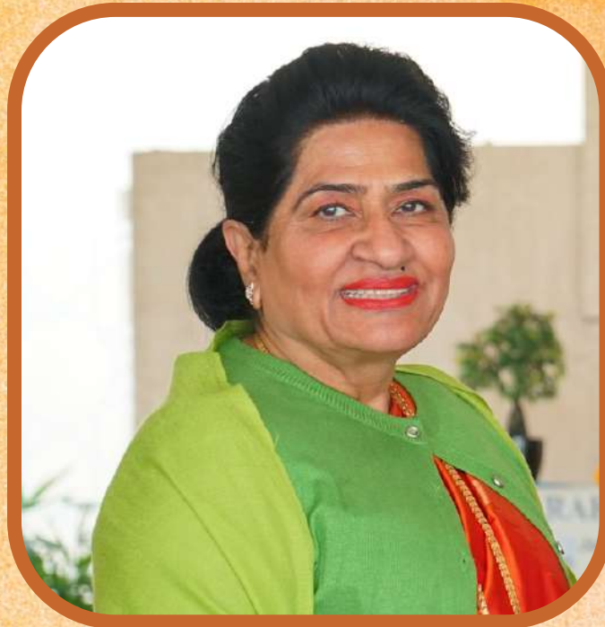
HON'BLE DR. JUSTICE MEENA V. GOMBER FORMER JUDGE - RAJASTHAN HIGH COURT CHAIRPERSON - GOMBER EDUCATION FOUNDATION CHIEF PATRON - RAFFLES SCHOOL OF LAW

The modern concept of legal education is to learn by bringing about a proportionate admixture of reading, observation, participation, and practice.