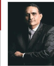
Late Shri. V.K. Gomber Founder President GEF

The undying spirit of the Gomber Education Foundation can be witnessed in the support it renders to government schools that are situated in close proximity, where facilities are replicated as in Raffles schools. The initiatives include upgrading of amenities, particularly in areas where these schools are found lacking in maintaining hygiene, such as restrooms for boys and girls where good standards of design, fit-out and maintenance reflects the Foundation's humanitarian approach. The Foundation is also creating computer laboratories to raise the level of computer literacy among students, besides upgrading libraries and