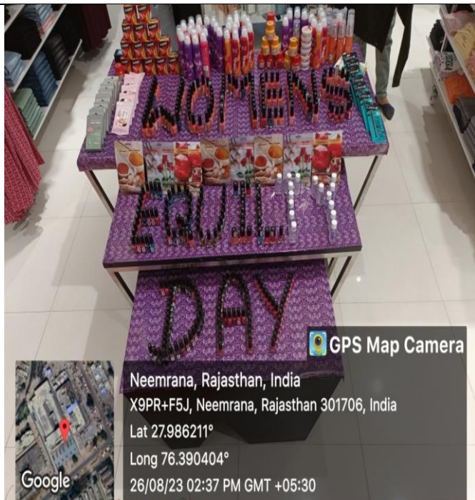
Women's Equality Day Celebration