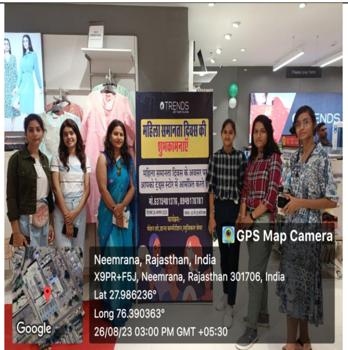
Women's Equality Day Celebration